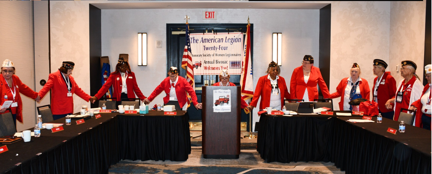
Bottom center: Circle of Friendship at Bivouac 2024.