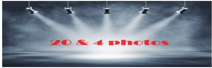
90th Lincoln Pilgrimage