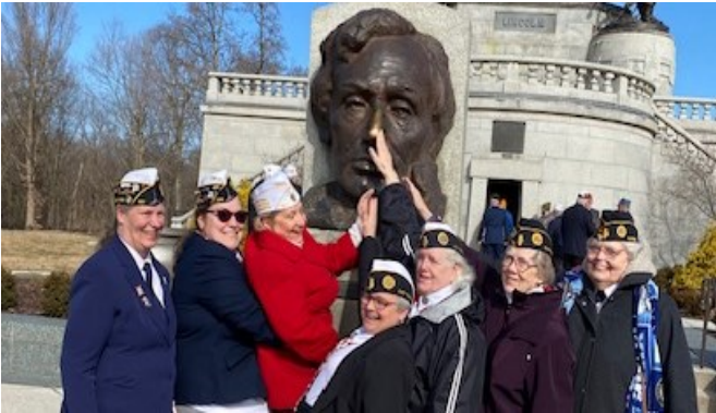
Having fun, giving Gi a lift up to reach Lincoln's Nose.