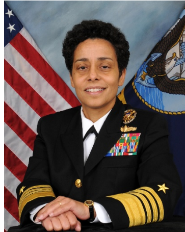
Michelle Howard Admiral