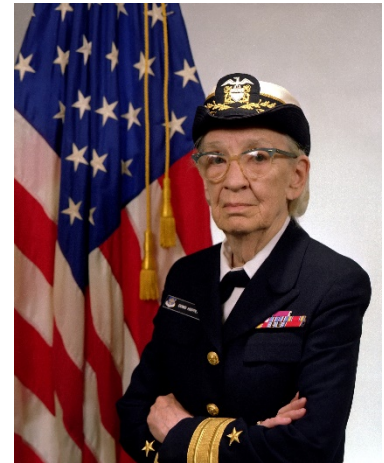
Grace Hopper Rear Admiral 1902 - 1992

March is Women's History Month and well over 200,000 women serve on active duty in the U.S. military. The contributions of women to military history (and well beyond) cannot be ignored. While Women's History Month isn't a time to focus exclusively on the contributions of women in military service, the contributions of female veterans are certainly an important part of American history.