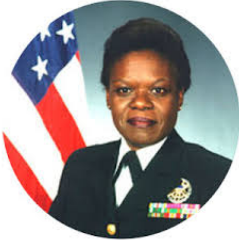
Lillian E. Fishburn Rear Admiral

During Black History Month, we commemorate the contributions and achievements of African American figures in U.S. History. We remember those men and women of color who served and made sacrifices in support of the United States military – despite the challenges and adversity – and we are grateful for their service every day. The list is long and we cannot fit them all here, but the following are just a few of the notable heroes from our military history.